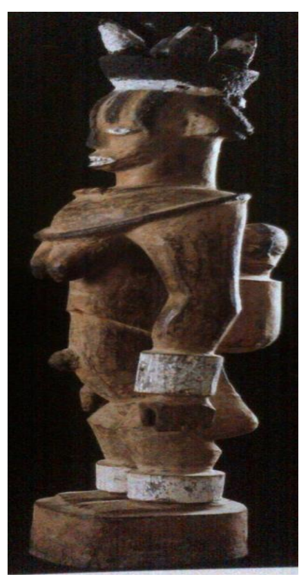
A Sculptural piece of Oniemo in Ovwu Community, A Sculptural piece of Oniemo in Udu, showcasing a woman breast feedingng her child showcasing a woman with her child strapped to her back

The next picture titled Aro osemo (fathers' shrine) is also produced in plastograph and in two dimensional formats. An Osemo ; (the cult of the ancestors in Urhobo land), is usually represented by a statuette of a stern looking man holding a weep in one hand and a wood or cutlass on the other hand. The osemo signify guidance of morality, disciplinarian, family head, and the bread winner of the home. At the dead of the man in the home and during the second burial rite, a sculpture representing the man is made and kept at the corner of the house and venerated. The sculpture is kept in the house of the dead man or with the first son and if the man does not have a son, but only daughters, it is kept with the younger brother's son's house or whose