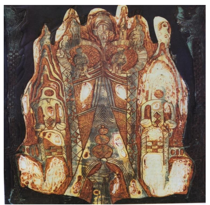
Aro Oniemo (mother's Shrine). Blue base. Plastograph. 61cmx45.8cm.1972.

water-side. Bruce explained that ant hills have interesting sculpture forms especially when they have become old or slightly eroded by rain. If an ant hill is still active, that if the ants still live in it, one can always find layers of earth growing around the old one thereby forming contrasting earth hues new texture and shapes (Singletary 2002). According to Prof Nabofa, the Urhobo woman is seen as an ant hill because of her ability to bring forth children. They frown seriously at any woman who could not bear a child. She is described as Oshare (a man), oreda (witch); O vwo omo re wvo keda gbara vwo be gbe . (She has mortage her children at the coven). She is treated as a leper and she is not accorded a proper burial right because she has no one to carry out her name (Nabofa. 2009). She doesnot have an Oniemo sculpture.