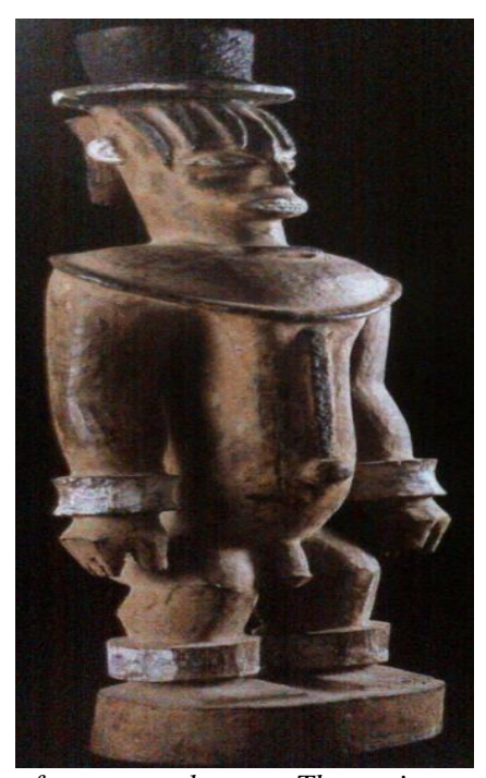
Picture of osemo sculptures. These pictures were taken at a community shrine at Ughelli.

In projecting the cult of ancestors, Bruce Onobrakpeya conceptualises the importance of motherhood in two dimensional formats. This he titled; Aro oniomo (mother's shrine). The technique of production is additive plastograph and the picture is a tribute to mothers (Onobrakpeya 1990). According to him, it is a tribute to women in their role of bringing forth children to life, nursing them to adulthood and at the same time providing for the needs of the household within the family system.